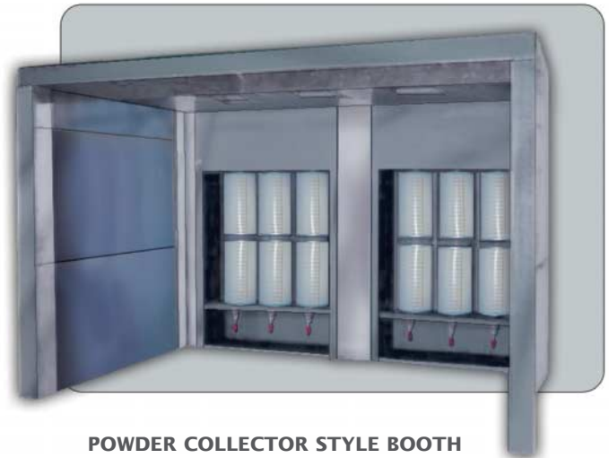
POWDER COLLECTOR STYLE BOOTH

This feature assures the safe operation of the coatings enclosure, by maintaining the airflow at design levels. During operation overspray powder accumulates on the cartridge filters. As the cartridge filters load, airflow decreases and negative pressure rises within the air handler. A timer activates a system of air purging valves that clear the cartridge filters of accumulated powder to ensure maximum filter life.